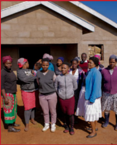
Challenge Ministries in Eswatini