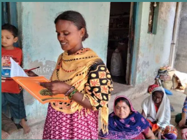
Adult Literacy Program in India