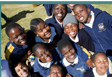
Challenge Ministries in Eswatini