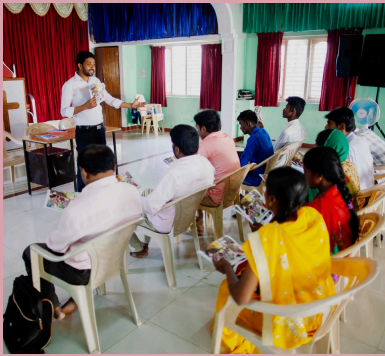
Church Planting in India

We can't wait to see how God will grow these partnerships in the years ahead, and how He will use them to transform lives and expand Gospel access around the world. As we step forward, we do so expectantly, believing that the work God began in this season of discernment will bear fruit for His glory among the nations.